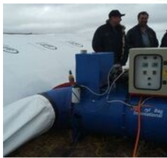
Aeration Drying with fan