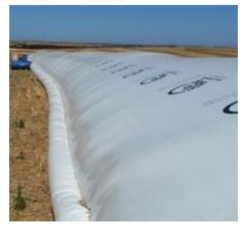
Grain Bag Storage