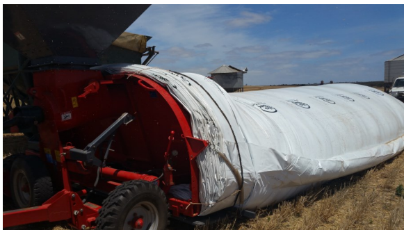
Filling with a standard bagging machine