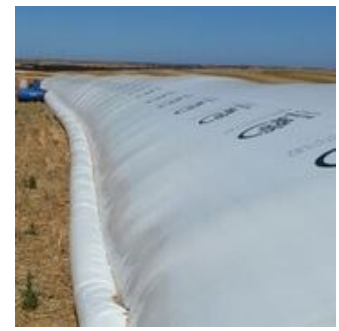
Grain Bag Storage